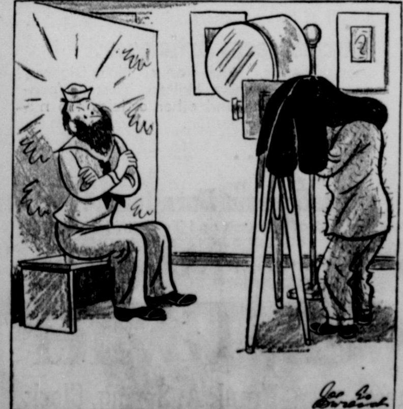
"I AM Smiling!"