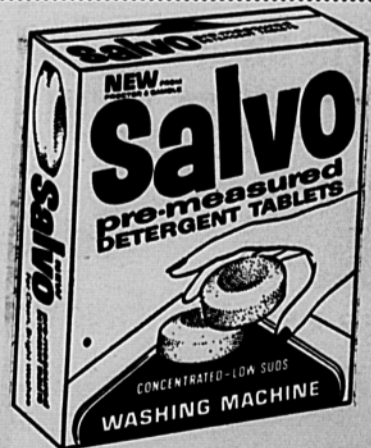
Giant Size Box 79c