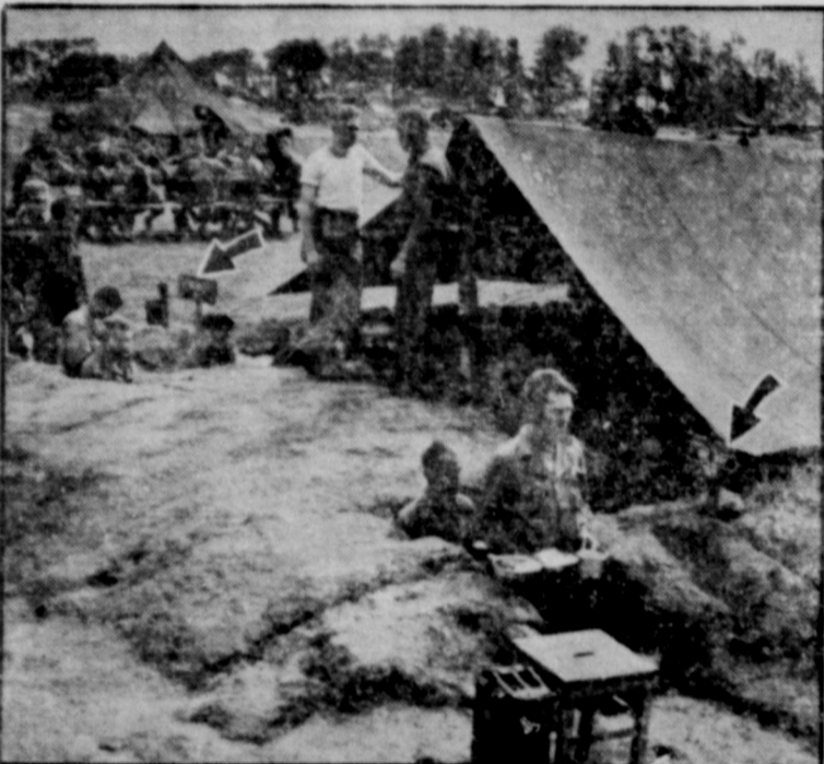
Having experienced the Luftwaffe's penchant for strafing chow lines, the G. I.'s at a 9th AAF base in France go "underground" at ration time. The signs say "One Way In" and "One Way Out."

Gripsholm a few weeks ago, and is recovering from bullet wounds in the left hand, arm and side, and shrapnel wounds of the shoulder and face.