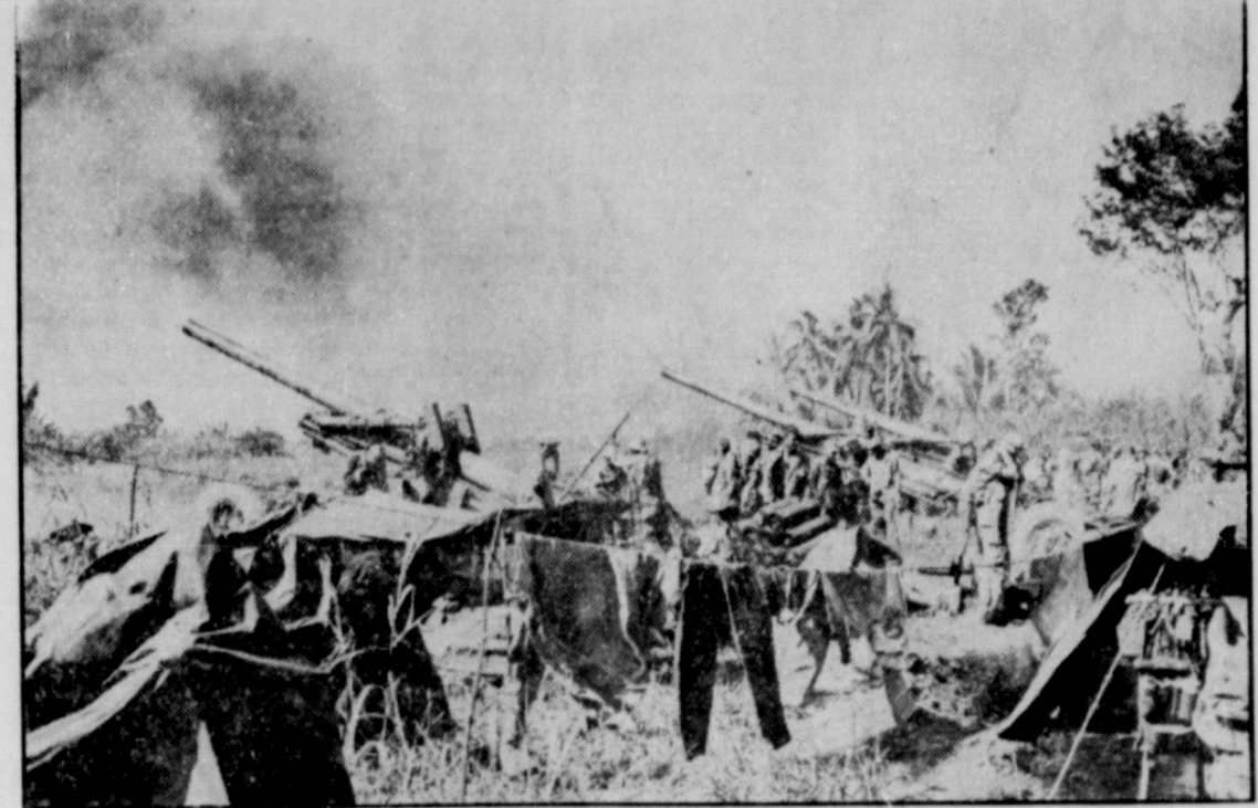
While crewmen hold their ears against the impending explosion, American artillerymen poised to cut loose with a battery of "Long Toms" at Carigara Bay, Leyte, P. I. Note the "laundry" strung up in the foreground.

The dinner was served by members of the Friona Women's Club at the club house, Thursday evening.