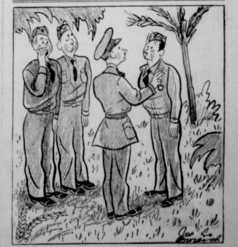
"The jeep he was driving got out of control and knocked off six Jap machine gun nests."