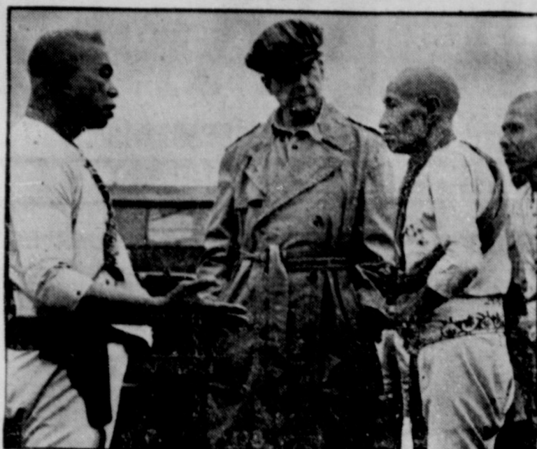
The Governor of Jolo, left, tells General MacArthur about the greatness of the Sultan of Sulu, right, who has 26 wives and more than 100 children. These are Moro natives of the Sulu Archipelago in the Philippines. They are Mohammedans.