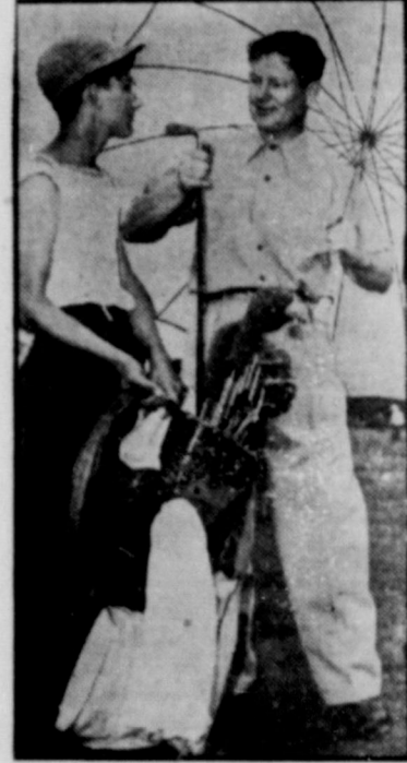
Champion golfer Byron Nelson takes out his putter as caddy Donnie Fox holds the bag during a recent tournament at Chicago. Note the parasol Nelson totes to protect himself from the sun.