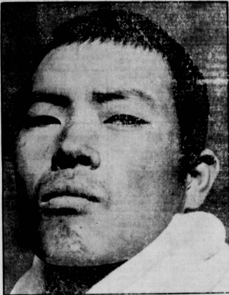
Fierce though he looks, this is a sample of one of the more sensible of our Jap enemies; he surrendered—perhaps alone, maybe with a group—in the Kerama Islands off Okinawa rather than be killed. Mass surrenders are extremely rare, but they're happening now and then—now, inculcated with the Bushido spirit of a "brave" death for the Emperor, most Japs fight until killed—more than 100,000 on Okinawa.