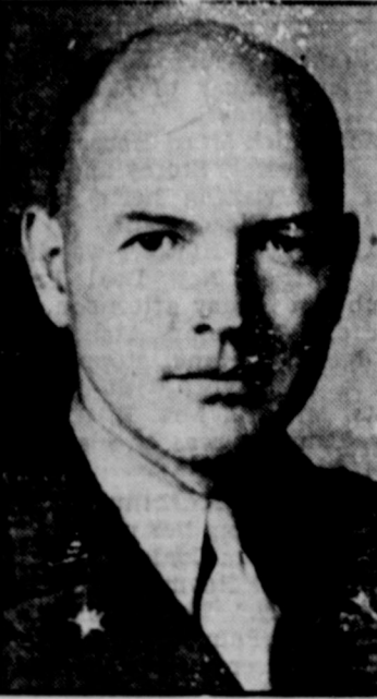
Maj.-Gen. Floyd L. Parks commands the U. S. First Airborne Army of the occupation in the south and southwestern "American zone" of Berlin.

ated—it must be given by hypodermic into the vein, or deep in the muscles, and the dosage must be repeated at stated intervals if the drug is to have the full effect through the blood stream.