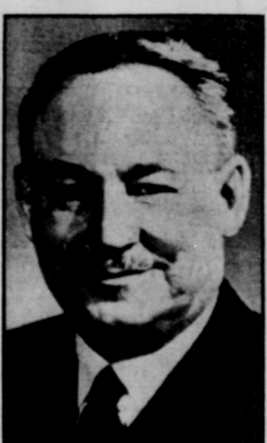
Rear Adm. Sidney W. Souers, USNR, of St. Louis, Mo., heads the new Central Intelligence Agency for co-ordinating foreign intelligence activities of the government.

Foreign Minister Trygve Halvdan Lie of Norway is new Secretary General of the United Nations Organization. The post carries a salary of $20,000 a year plus a like amount for expenses. Lie's first task is to recruit seven assistant secretaries general.