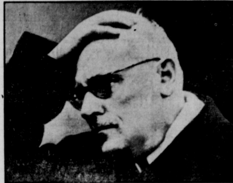
Soviet Vice Commissar of Foreign Affairs Andrei Vishinsky, photographed in a moment of deep concentration at the UNO meeting in London, is focal point of arguments over the Soviet-Iranian dispute. Vishinsky claims it's none of UNO's business.

An allotment of $198,000 for construction of rural electric lines by the Deaf Smith county REA Cooperative has just been approved by the Rural Electrification Administrator in Washington, according to a telegram from Gene Worley, Member of Congress from this district.