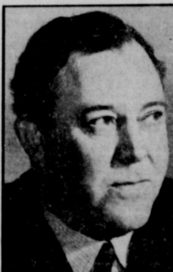
Foreign Minister Trygve Halvdan Lie of Norway is new Secretary General of the United Nations Organization. The post carries a salary of $20,000 a year plus a like amount for expenses. Lie's first task is to recruit seven assistant secretaries general.