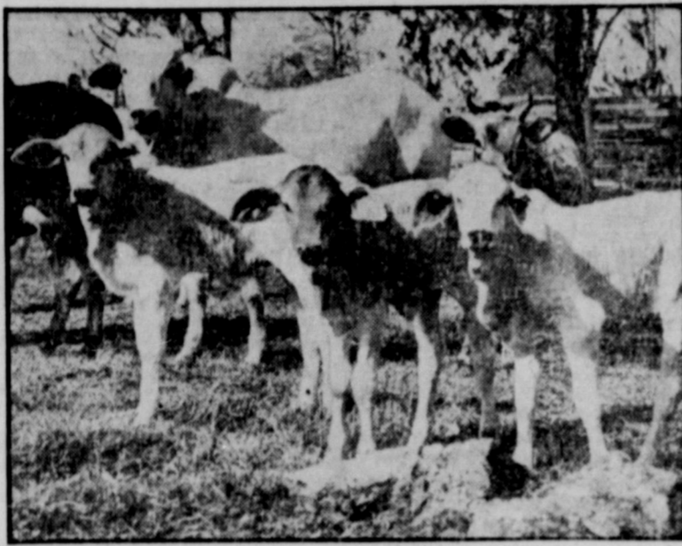
These are typical examples of the new Brahman breed. They grow heavier and meatier than American cattle, and, unlike American cattle, they do their loafing in the sun instead of the shade. In Florida as in other cattle states cowboys ride herd on horseback.

Quite a number of good speakers and singers will be here from various sections of the country. We extend a cordial invitation to the people of the community to come and en-