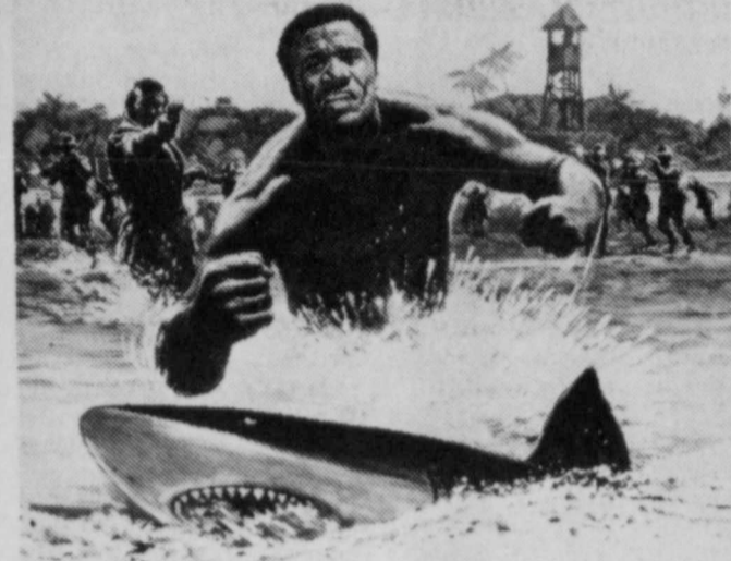
JIM BROWN is cast as the one man on Devil's Island the famous prison fortress could not hold. Scene above from "I Escaped From Devil's Island," showing Sunday at the Seale Drive-In. Shows his escape through shark-infested waters while being fired at by prison guards.

Wichita Falls for a luncheon. Afternoon schedule includes Quanah, Amarillo and Lubbock. The second day of the West Texas tour will begin with a coffee and reception in Snyder followed by visits to Weatherford, San Angelo, Midland and Odessa. The day will conclude with a dinner-reception in the Inn of the Golden West in Odessa, Texas where the Governor will address the annual meeting of the West Texas Chamber of Commerce. Briscoe Campaign coordinators in the region whose cities are not covered by the tour are planning to have friends and supporters of the Governor drive to the nearest city to be visited so that as many communities as possible will be represented. Exact times and places scheduled for the Governor's visit are as follows: April 18, Brownwood, 8:10 a.m., Holiday Inn; Abilene, 10:15 a.m., Hardin Simmons University; Wichita Falls, 11:45 a.m., Horizon House; 12:15 p.m., Mid-Western University — Sikes Mansion; Quanah, 2:30 p.m., Copper Brakes State Park; Amarillo, 5 p.m., Hilton Inn; Lubbock, 8 p.m., South Park Inn. April 19, 1974: Snyder, 8:15 a.m., West Texas Jr. College; Weatherford, 10:45 a.m., 816 Jefferson — Art Festival Opening; 11:40 a.m., Holland Park; San Angelo, 2:15 p.m., Central National Bank Building; Midland-Odessa, 4 p.m., Midland Airport-Rich Air Building; 5:15, University of Texas of Permian Basin - New Administration Building; 7:45 p.m., Inn of Golden West.