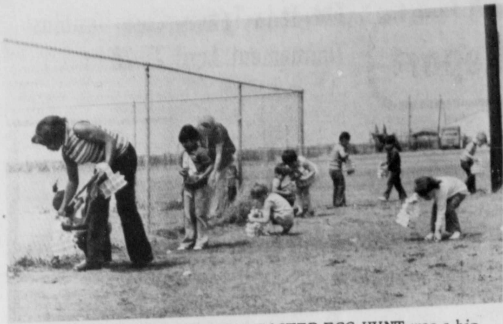
FLOYDADA DAY CARE CENTER EASTER EGG HUNT was a big success.