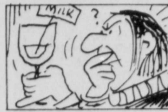
Milking was unknown in the New World prior to the 16th century!

TOO LATE TO CLASSIFY GARAGE SALE — Children's clothes, twin bed box springs, bed frames, furniture and household goods. 223 West Virginia, Floydada. 8 to 5 Saturday only. 4-18