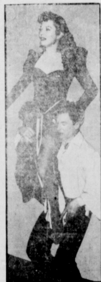
Greer Garson is just one of 200 Hollywood stars who volunteered to perform at a hospital benefit circus. Here, she rebalances for her acrobatic act.