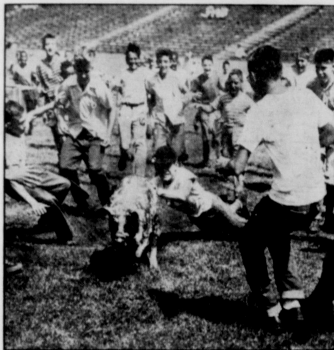
Soldier Field, scene of many a pigskin battle, is the site of a new form of the sport, as a greased porker eludes youngsters trying to capture it in a contest at the Cook County, Ill., Fair.