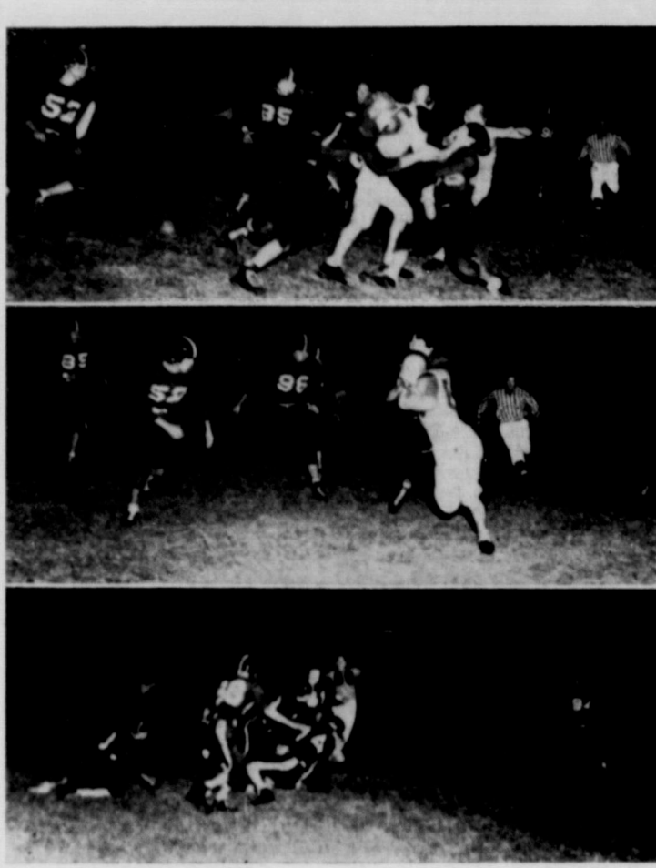
Shown above are action shots of the initial 1948 home football game resulting in a 19-6 victory for the McLean Tigers over the Hereford Whiteface team. Hereford players are wearing the dark uniforms.