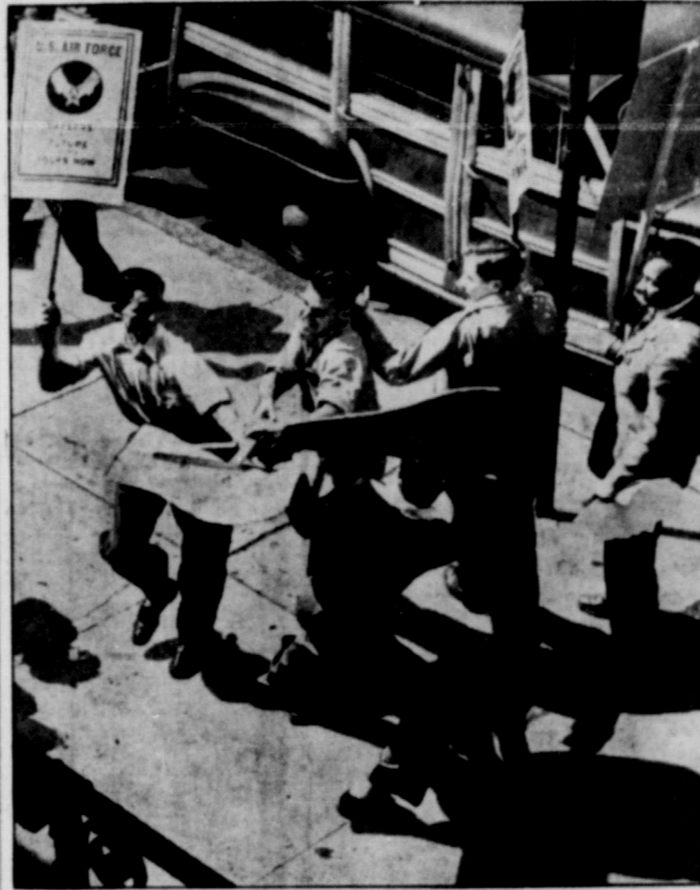
Anti-draft pickets and veterans urging enlistment try to destroy each others' placards in a tussle outside Cadet Armory in Boston, Mass. Scenes like this were common throughout the nation as men from 18 to 25 registered in the second peacetime draft in U. S. history.