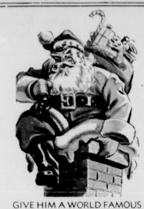
RONSON CIGARETTE LIGHTER

We Have a Good Selection to Choose From GIVE A GIFT FROM ALLEN'S THIS CHRISTMAS