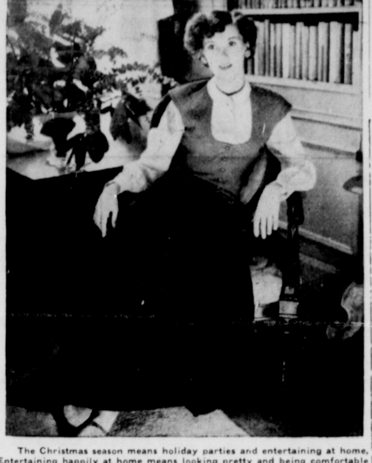
Entertaining happily at home means looking pretty and being comfortable of farms and ranches, the usual for the hostess. The costume shown above answers both problems. A stark reliable tank went dry. Result: white blouse worn with a pleated dark skirt and bright colored vest are water had to be hauled in, or right for home or for the social season anywhere.