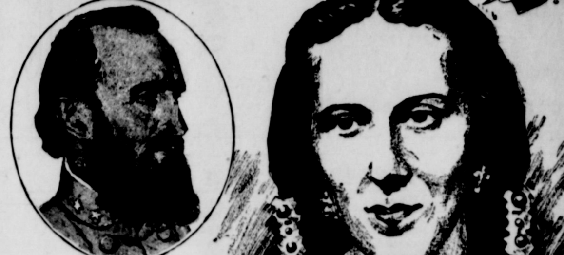
"STONEWALL" JACKSON By ELMO SCOTT WATSON

ELLE BOYD is going home—back to her beloved Valley of the Shenandoah. For nearly thirty years one of the most famous spies in all American history has slept in what to her was alien ground—in a little cemetery near Hillsboro, Wis.