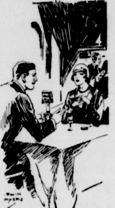
All the Same," said Waterman, "the sooner you change your address the better."

Wilson accepted the rebuff and stayed. He thought vaguely that possibly his continued presence might in some way be useful to the absent Stanley. But there came a time when he felt that merely from the standpoint of self-protection he must get out. That moment came when he realized that Waterman's business forthrightness had become something worse.