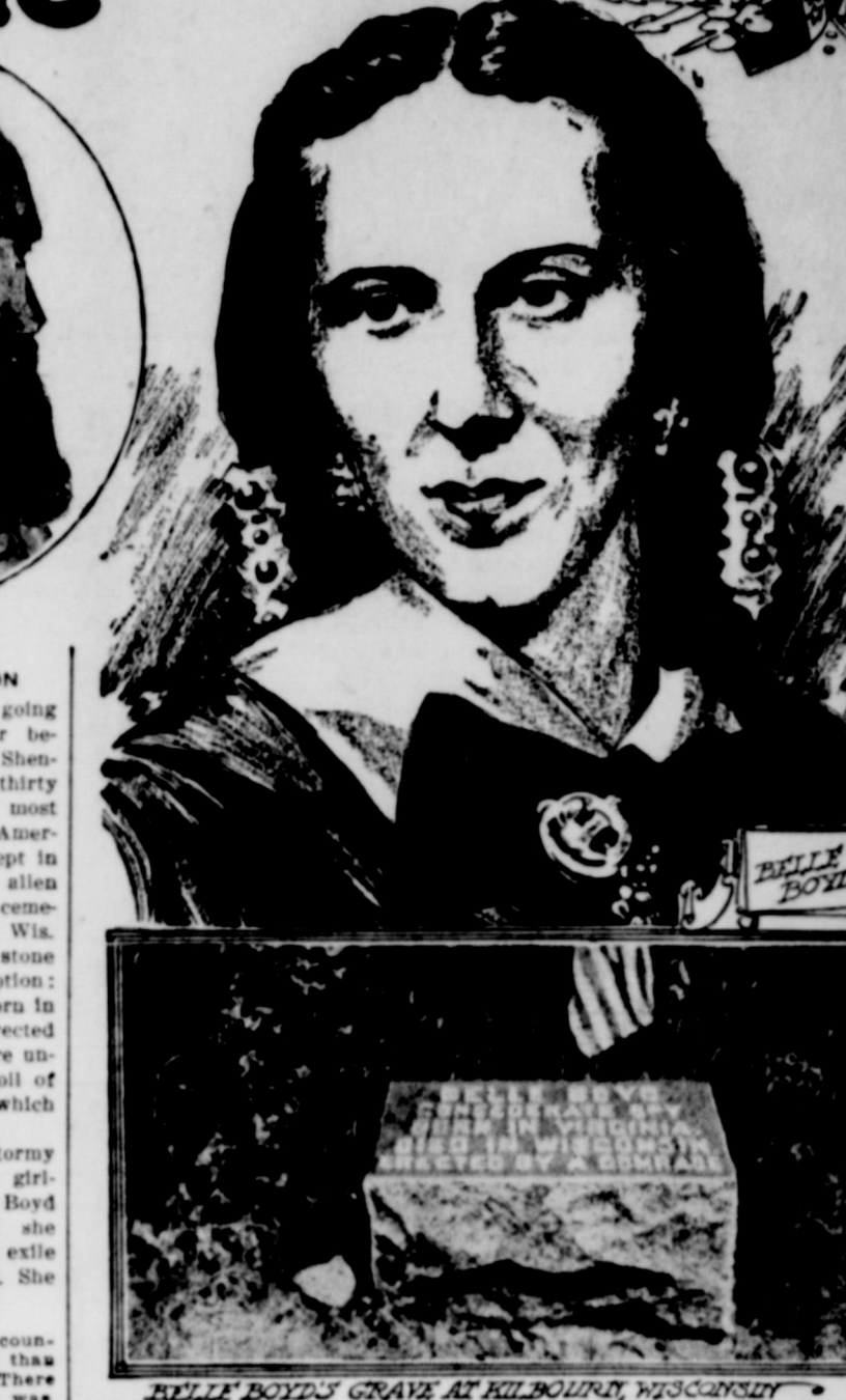
BELLE BOYD'S GRAVE AT HILLSBORO, WISCONSIN

Assam Bridal Custom Custom has imposed upon brides in Assam a considerable amount of trouble before their prospective husbands are safely tied up. On her wedding day the bride is garishly attired in a gown flashing with brilliants, and with a band of jewels holding up her veil.