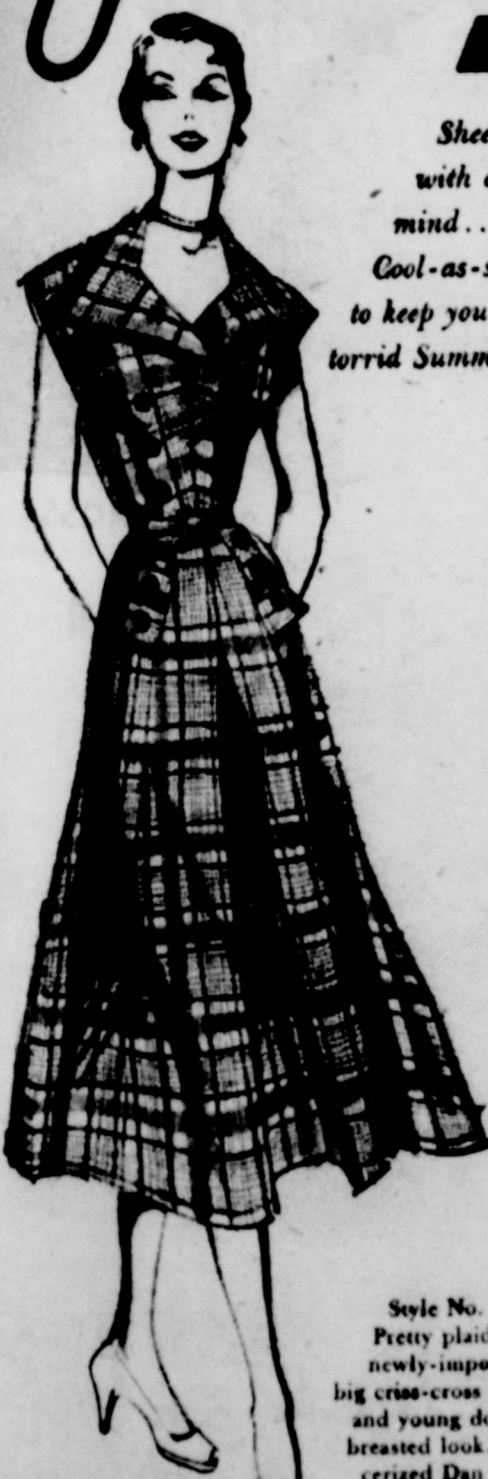
As Seen in MADEMOISELLE

Sheer beauties designed with one purpose in mind... to flatter you! Cool-as-shade cottons to keep you refreshed on torrid Summer days!