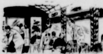
AUDUBON DINING ROOM, beautifully decorated... completely equipped for sumptuous dining.