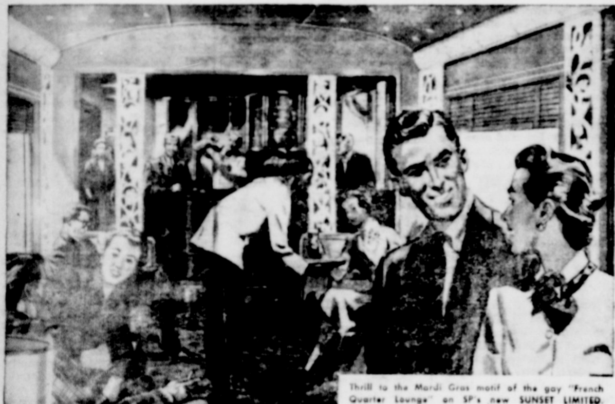
Thrill to the Mardi Gras motif of the gay "French Quarter Lounge" on SP's new SUNSET LIMITED.