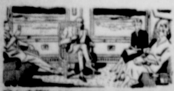
DELICIOUS ROOM SUITES, a fine conference

THE "ARGONAUT"—SP's other daily train to California, now leaves Sanderson 9:50 a. m., arriving Los Angeles 3:45 p. m. next afternoon. Standard Pullmans, economical Tourist Sleepers, diner, lounge car, chair cars.