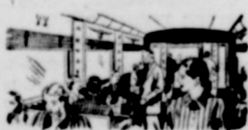
"PRIDE OF TEXAS" COFFEE SHOP-LOUNGE, dining, lounge facilities for all passengers.