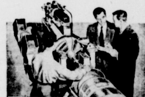
When you come to check the field you'll find that there's a sweet freedom from roughness to this engine's operation—tracing to the fact that the whole mechanism itself is engineered smooth, and the further fact that every Fireball Engine gets a Micropoise balancing after assembly.