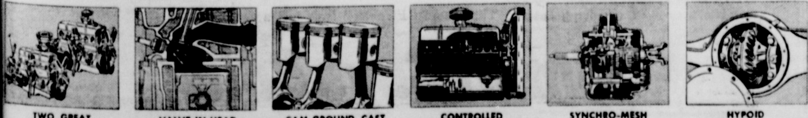
TWO GREAT ENGINES

More Chevrolet Trucks in Use Than Any Other Make!