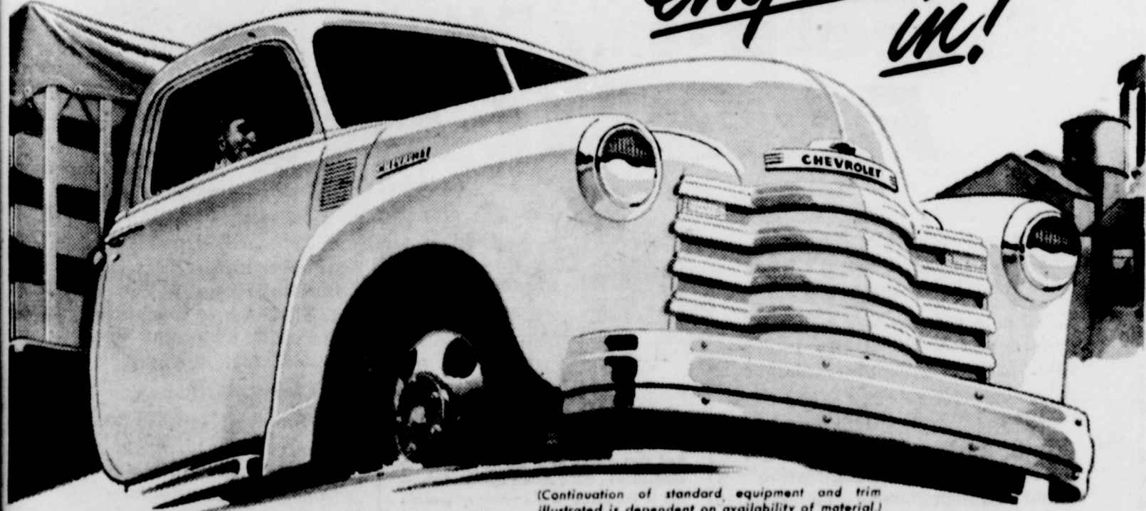
(Continuation of standard equipment and trim illustrated is dependent on availability of material.)