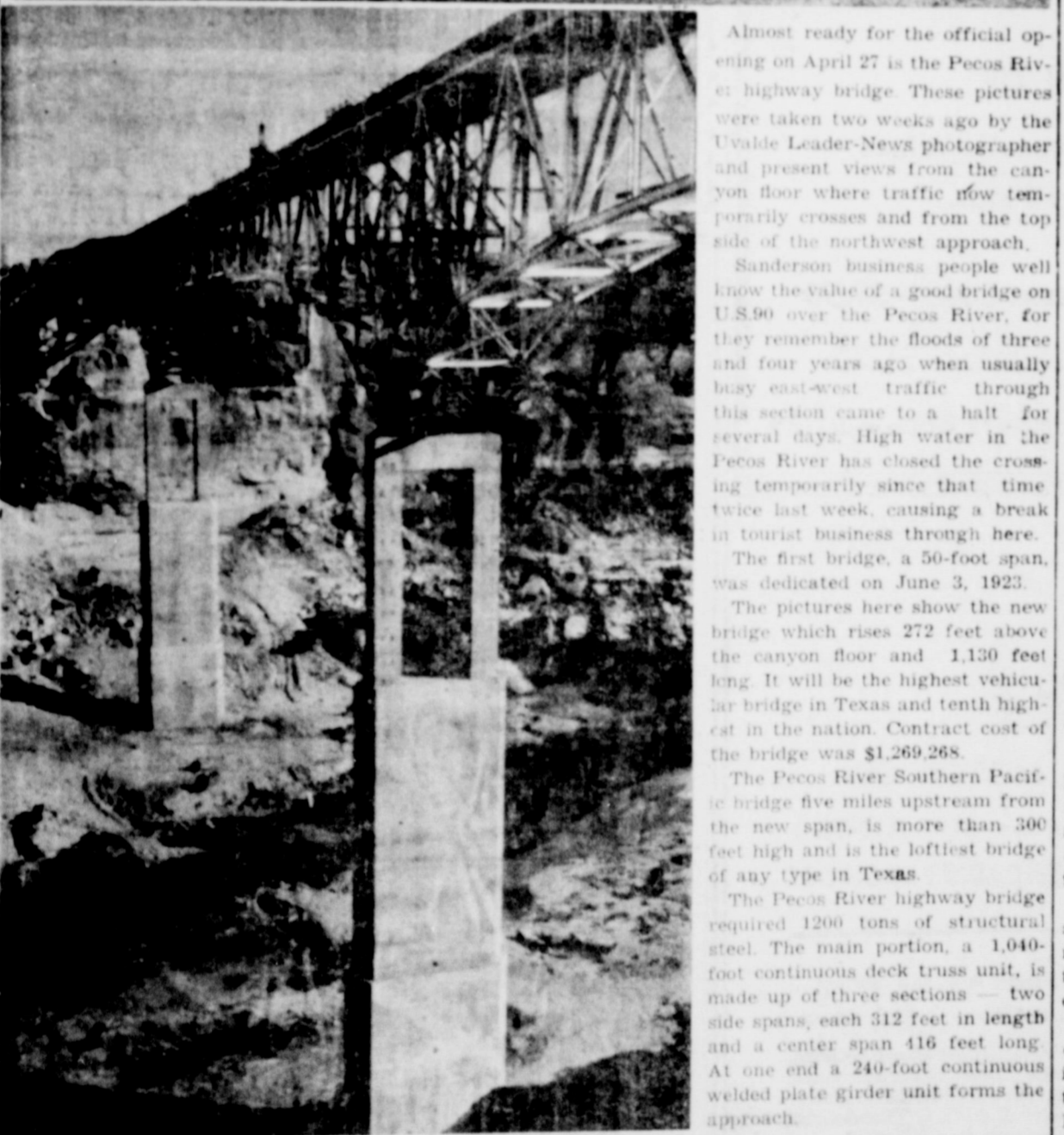
Almost ready for the official opening on April 27 is the Pecos River highway bridge. These pictures were taken two weeks ago by the Uvalde Leader-News photographer and present views from the canyon floor where traffic now temporarily crosses and from the top side of the northwest approach.

Sander son business people well know the value of a good bridge over the Pecos River, for they remember the floods of three and four years ago when usually busy east-west traffic through this section came to a halt for several days. High water in the Pecos River has closed the crossing temporarily since that time twice last week, causing a break in tourist business through here.