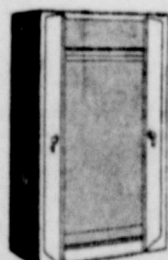
← WARDROBE With hat shelf plus rod for coat hangers. 36" w., 76" h., 18 1/2" d. No. 76B.

Will keep your office supplies and printed matter clean and orderly. Pays for itself by preventing pilferage. Doors are equipped with a two-way locking device controlled by a paracentric lock. Five adjustable compartments. Size, 36" wide, 76" high, 18 1/2" deep. Olive green or Cole gray finish.