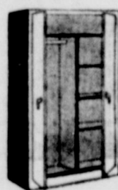
← WARDROBE and STORAGE CABINET With 3 adjustable shelves, a hat shelf and coat rod. 36" w., 76" h., 18 1/2" d. No. 76C.

The Sanderson Times Office Supplies Headquarters