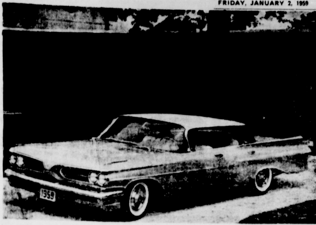
REPRESENTING THE MOST progressive change in Pontiac Motor Division's 51-year history is the Catalina Vista. The beautifully contoured Vista-Panoramic windshield and large, wrap-around rear window provide unparalleled vision for driving safety.

Wesleyan Methodist Church Worship Service Wednesday at 8:00 p.m.