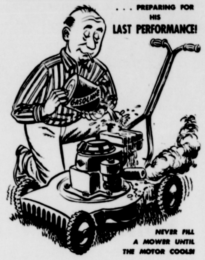
NEVER FILL A MOWER UNTIL THE MOTOR COOLS!

O. E. S. Names New Officers at Meeting Tuesday