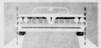
PONTIAC—THE ONLY WIDE-TRACK CAR! Pontiac has the widest track of any car. Body width trimmed to reduce side overhang. More weight balanced between the wheels for sure-footed driving stability.

Pontiac's Catalina! Trophy V-8 Power. Wide-Track balance. Nothing handles like it, hustles like it. No car anywhere near its price is anywhere near it. Drive one and you'll have one delivered.