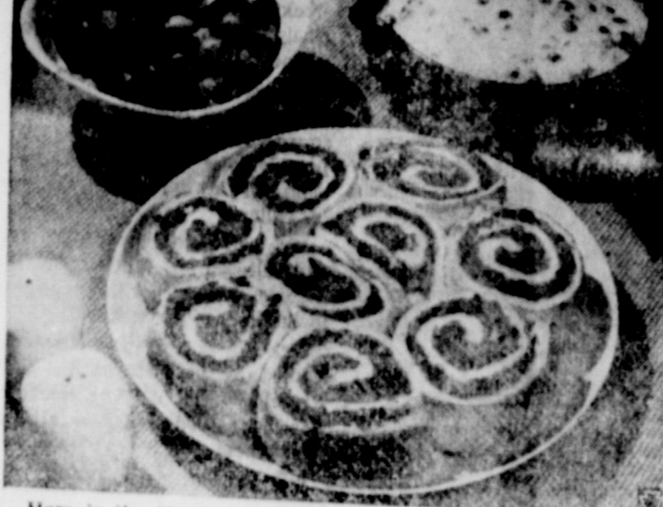
Here is the "basic ingredient" for a nutritious and tempting Lenten meal — savory Salmon Rounds with Creamed Peas.

Instead of going round in circles over ideas for dinner these days, go — Salmon Rounds, instead. Serve this tasty main dish, topped with a sauce of Creamed Peas, with a colorful potato salad and crisp vegetable relishes. Then top your menu with big wedges of fudge-frosted yellow cake.