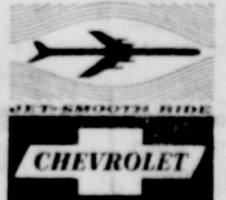
Nomad 4-Dr. 6-Pass. Station Wagon.

See the new Chevrolet cars, Chevy Corvairs and the new Corvette at your local authorized Chevrolet dealer's.