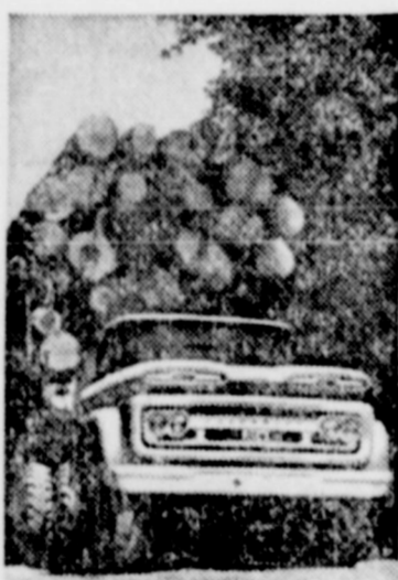
Chevy's hefty Jobmaster 6, standard in Series 60 middleweights, is known far and wide for its fuel-saving performance.

Western star Roy Rogers spreads the good word for your local dealer! "Right now he's making it easier than ever to own America's easiest riding truck. That's Chevy — the truck that saves you plenty with its special brand of Independent Front Suspension."