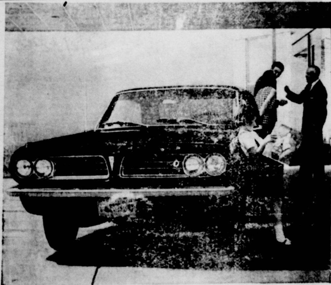
WATCH "OUR MAN HIGGINS," WEDNESDAY NIGHT, ABC TV

If you want a low-priced car ...with a Wide-Track ride... either buy a '63 Tempest ...or forget it