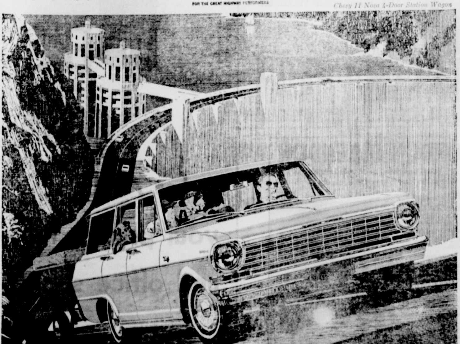
CHECK THE T-N-T DEALS ON CHEVROLET - CHEVELLE - CHEVY II - CORVAIR AND CORVETTE NOW AT YOUR CHEVROLET DEALER'S

spare tank. And now that it's Trade 'N' Travel Time at your Chevrolet dealer's, you'll never find a better time to buy a Chevy II. There's a wide range of engines and transmissions to choose from. And whatever you pick, you can be sure you'll always get a good run for your money.