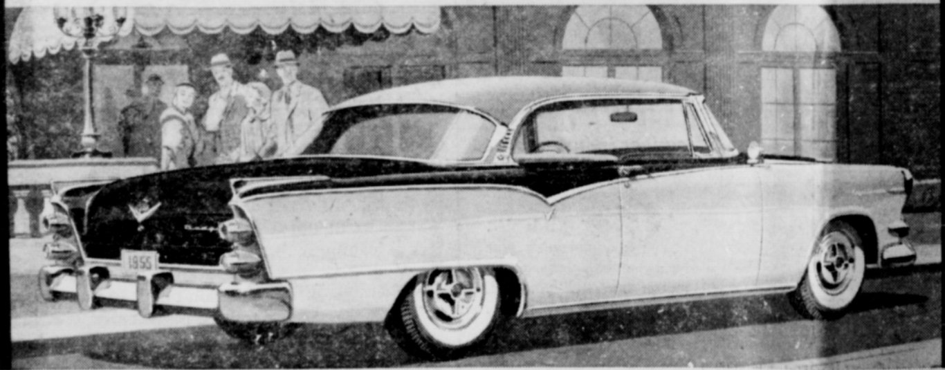
Rules the road in flashing style... the new Dodge Custom Royal Lancer with Three-Tone styling.

How do you think it feels to own this new Dodge? Well, the look in people's eyes tells you that no car at any price has captured America's heart so completely. It's not just its bigness and length — up to 9 inches longer than other cars