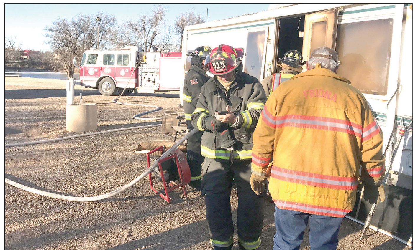
Emergency personnel responded to a trailer fire at Reeve Lake around 8:00 a.m. last Wednesday morning. Fortunately, no one was in the trailer and no other structures were in danger. The owner was out of town at the time of the incident but did come back later in the day and hauled the trailer away.