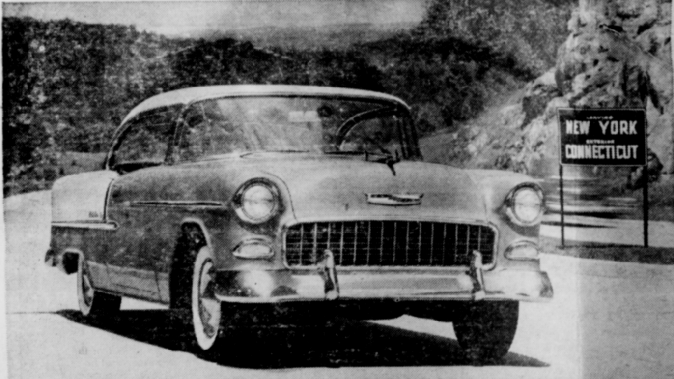
Great Features back up Chevrolet Performance: Anti-Dive Braking—Ball-Race Steering—Out-rigger Rear Springs—Body by Fisher—12-Volt Electrical System—Nine Engine-Drive Choices.

Aim that Chevrolet hood down a stretch of open road and relax. You're all alone! Because nothing in its field can match the stride of Chevrolet's "Turbo-Fire V8."