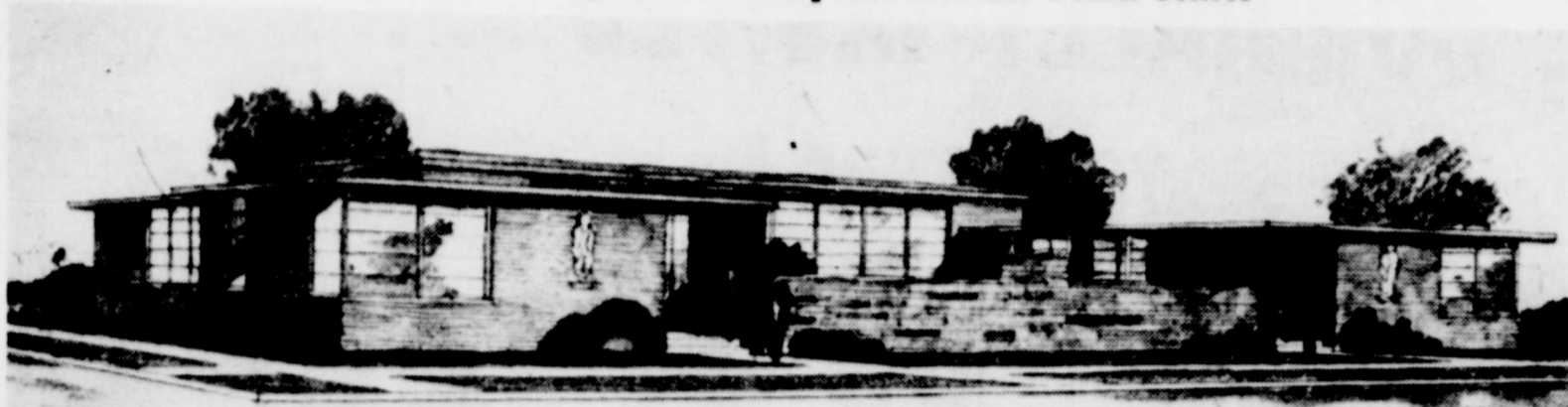
Architect's Sketch for the Proposed Rankin Youth Center. Cost Estimated at $112,942. Space to be Included for Use by Rankin Girl and Boy Scouts.