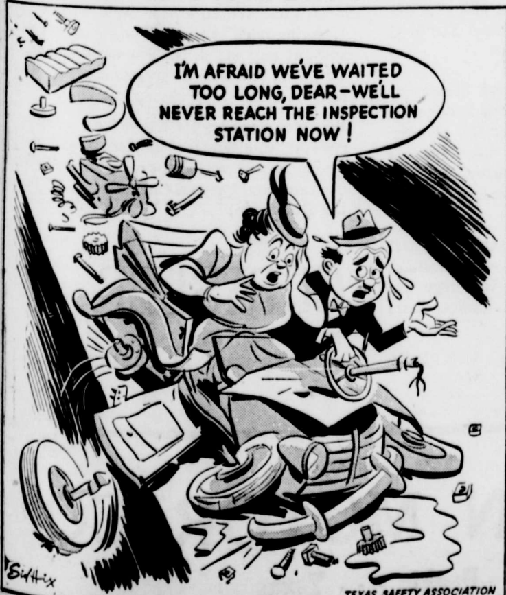
TEXAS SAFETY ASSOCIATION

DON'T WAIT! HAVE YOUR CAR INSPECTED NOW!