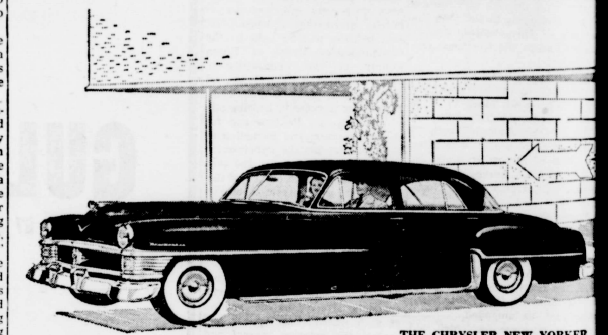
THE CHRYSLER NEW YORKER 6-PASSENGER SEDAN White side-wall tires at extra cost