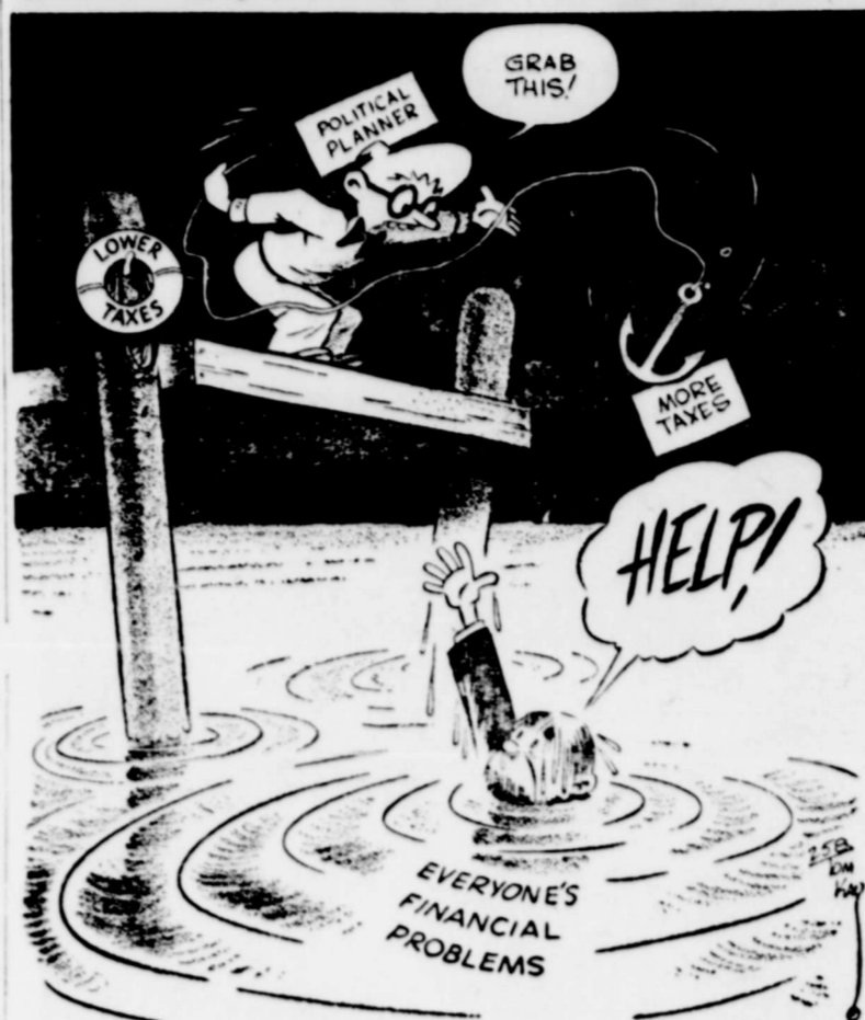
Throwing Out The "Death"-Line

The X-ray was so named because its discoverer was uncertain of the nature of the rays, and used "X" as a symbol. A cow's abomasum is its fourth or digestive, stomach.