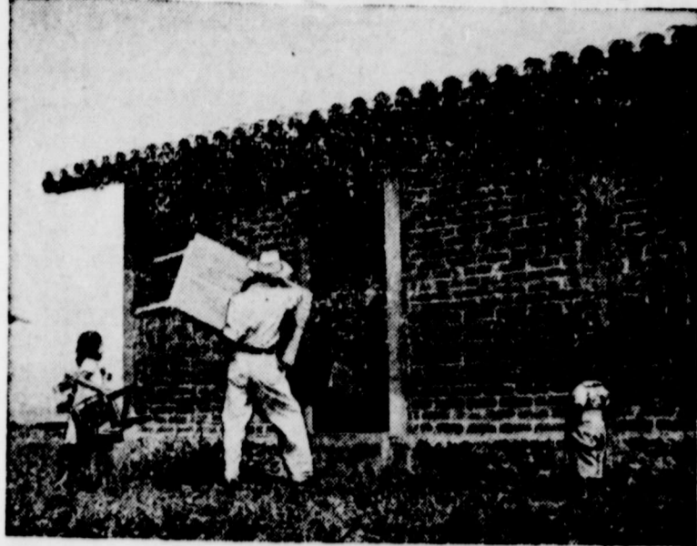
The young gentleman from El Salvador, hands in pockets, looks on approvingly as his father helps move the new furniture into their new home, one of 250 specially-designed new houses built by the government with the help of the specialized agencies of the United Nations. The housing project is part of a community development plan designed to better the living and working conditions of some 100,000 such valley dwellers in El Salvador.

see if I had accepted if you did not get my letter.