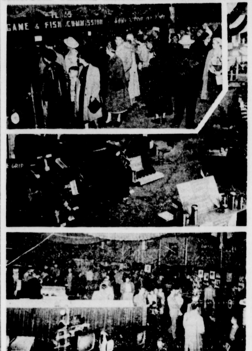
Cross-section view of the Annual Texas Ranch and Farm Show in exhibit buildings of the Fort Worth Stock Show Buildings, November 19-20-21-22. Top, show visitors viewing State Game and Fish Exhibit, which is a part of the Annual Ranch and Farm Show; center, machinery exhibit; bottom, farm home exhibit, appliances, services, etc.