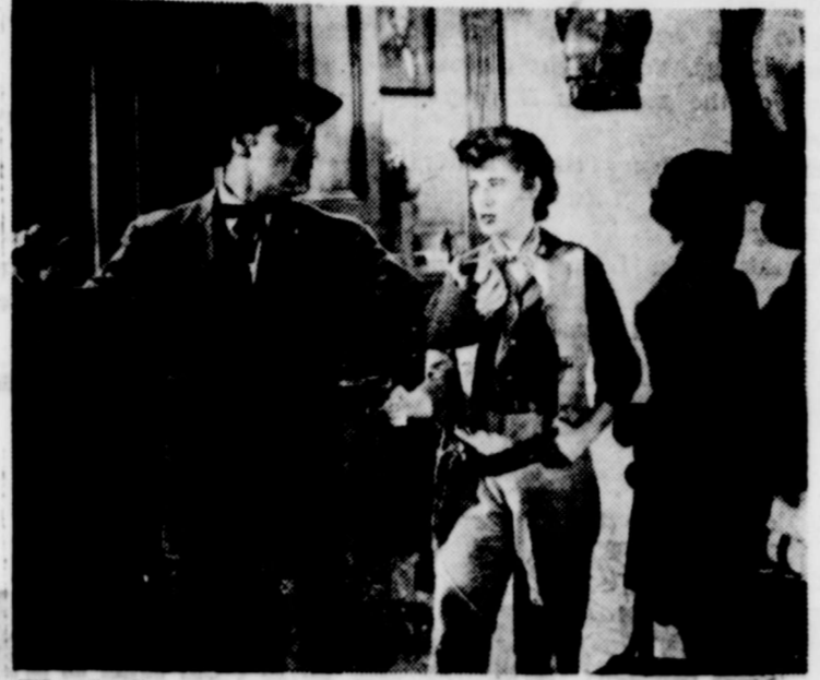
The lady means business. Tony Caruso respects the sixgun held by Nancy Olson. Will Rogers, Jr., co-stars in Warner's WarnerColor "The Boy from Oklahoma."

THE RANKIN (Tex.) NEWS— THURSDAY, FEB. 11, 1934