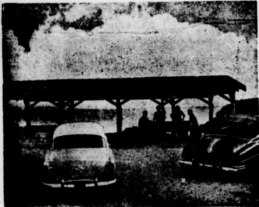
GOOSE ISLAND STATE PARK's camp shelters overlook salt water at vantage points on the island which is a favorite haven of wild geese. Most of the park is on the mainland touching three coastal bodies of water—Aransas, Copano and St. Charles bays. The park is 10 miles north of Rockport, Texas, on State Highway 35 at the Copano Bay causeway.