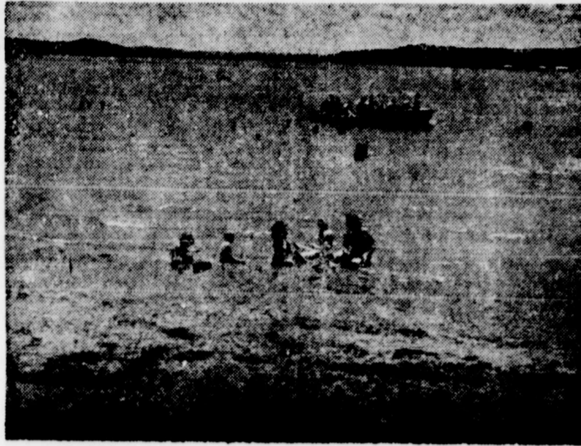
INKS LAKE STATE PARK is so famed for its fishing that many people overlook its fine sanded beach and other recreation features. It has the most constant level of the six Highland Lakes. The park road intersects U.S. Highway 261 south of Burnet and State Highway 29, near Buchanan Dam.