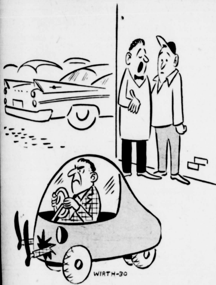
"I think his brakes are grabbing."