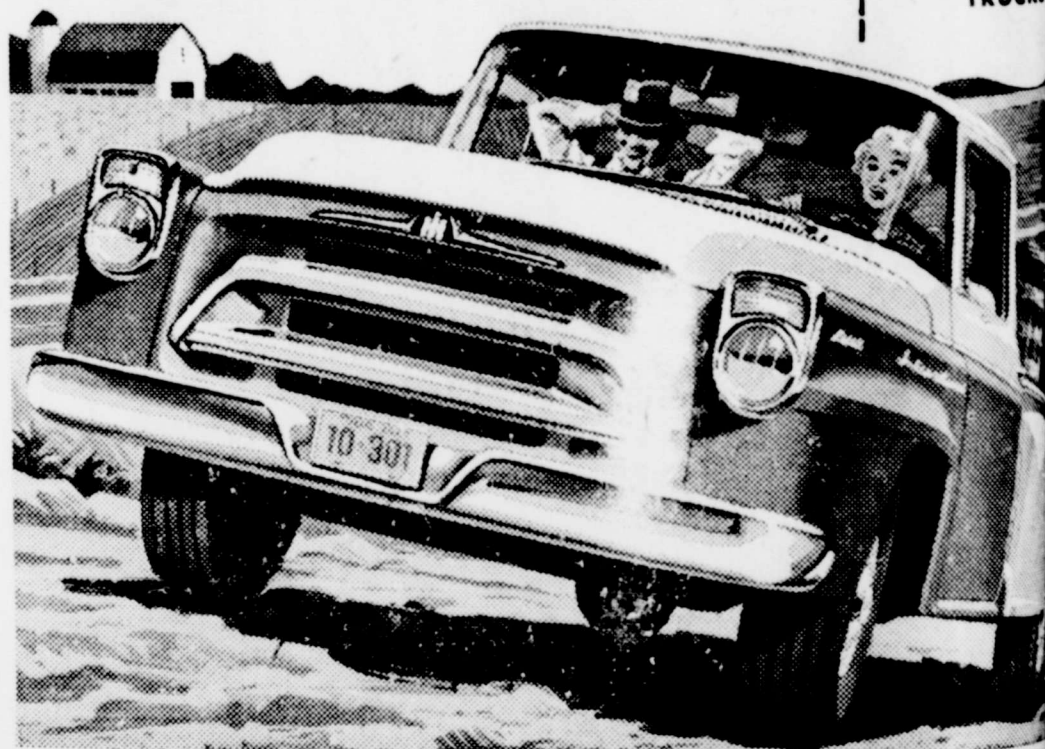
The world's most complete truck line — 1/2-ton to 96,000 lbs.

Treat yourself to a drive on us . . . today!