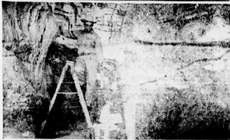
A completely new and improved lighting system has just been installed in Texas Longhorn Cavern near Burnet which provides dramatic illumination designed to best show off the scenic wonders of this marvel of Nature. Many modern theatrical lighting effects have been utilized. More than four miles of wiring were installed and nearly a thousand electric bulbs were used in the project which required over five months.