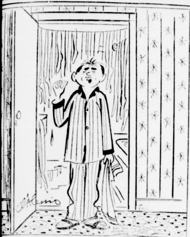
"You've changed the decor in the bathroom, darling. Today, it's all stockings!"