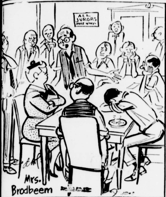
Maybe he HAS innocent laugh lines dancing about his blue eyes, but the evidence clearly shows he's guilty!"