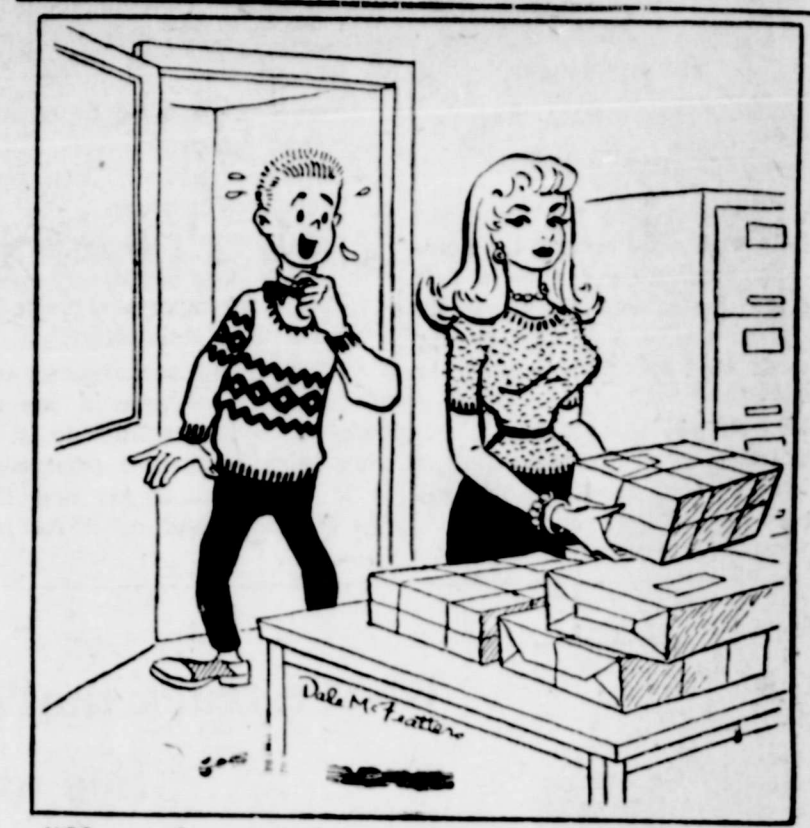
. . . good morning! I'm the new help that's been sent to office boy you!"

FOR THE BEST DEAL IN WEST TEXAS ON A BRAND NEW