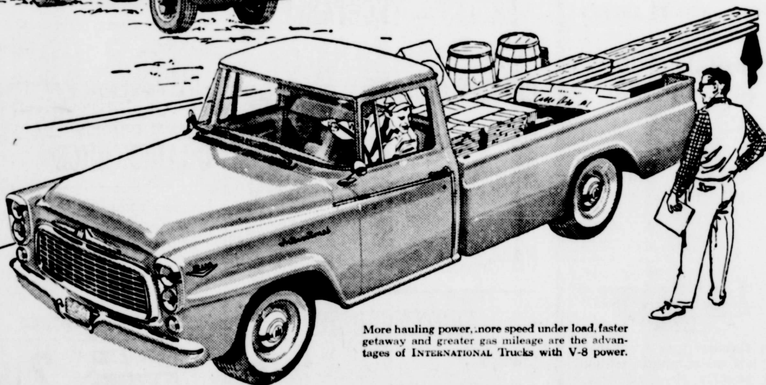
More hauling power, more speed under load, faster getaway and greater gas mileage are the advan- tages of INTERNATIONAL Trucks with V-8 power.