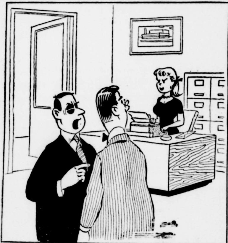
"She's having a bit of trouble adjusting to the office routine!"