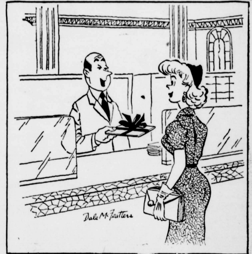
"Your first deposit, miss?"