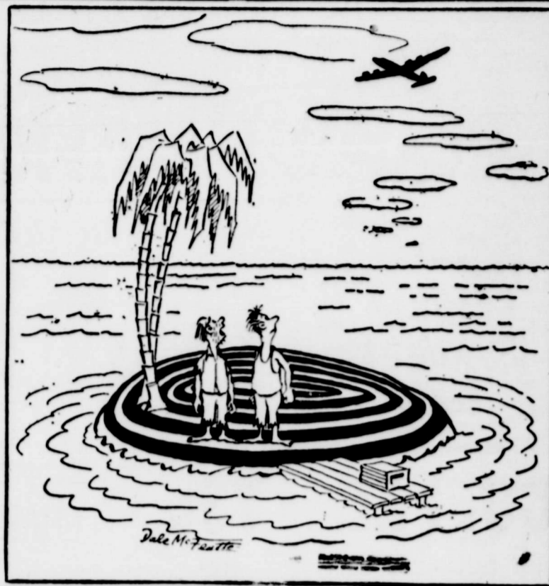
"I don't like it, Edgar!"