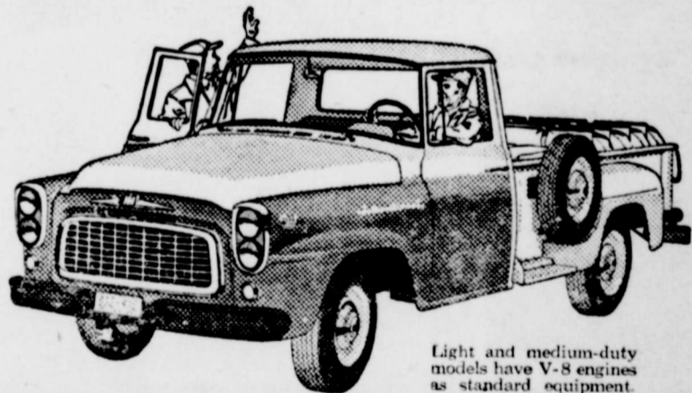
Light and medium-duty models have V-8 engines as standard equipment.