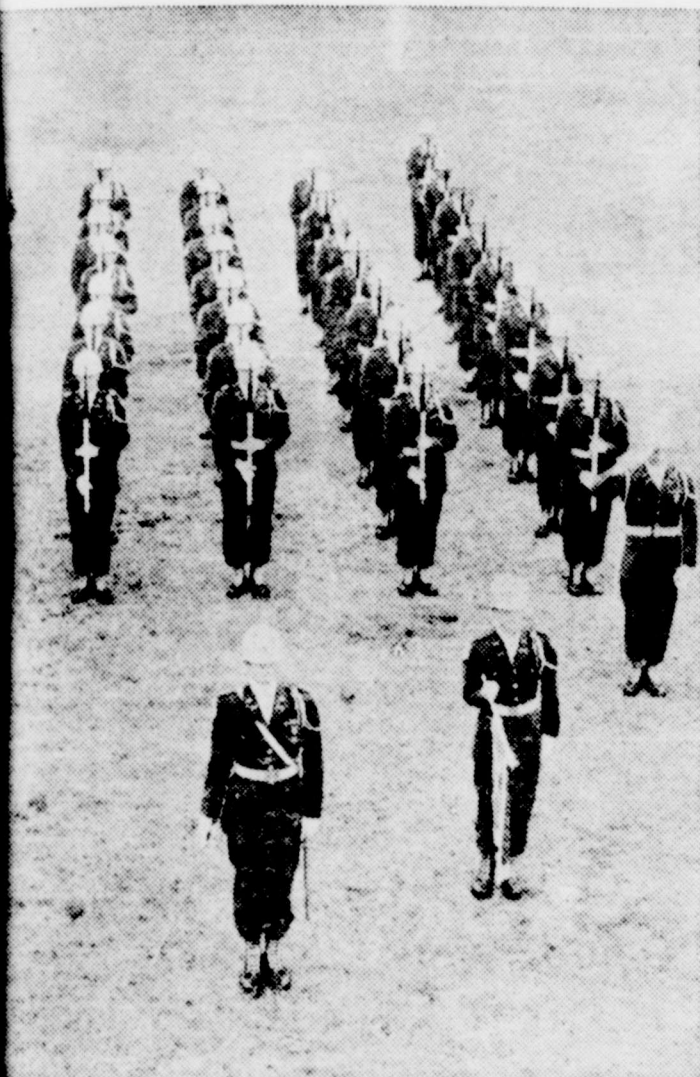
The Wainwright Rifles

Students, Scouts, Organizations and Individuals to Help --