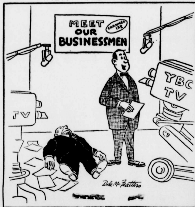
"Does your first television appearance make you nervous, Mr. Pottleby?"

ALL BRANDS of cigarettes on sale at Rankin Automatic Laund.