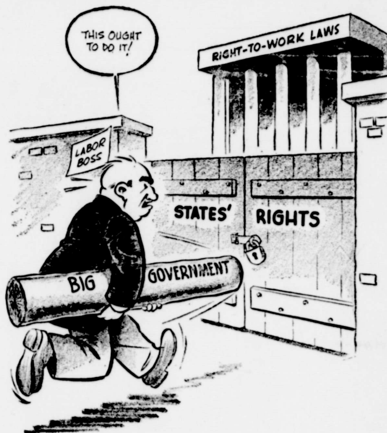
He Never Gives Up