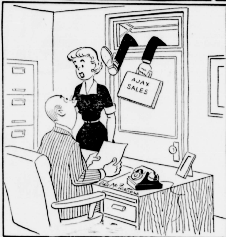
"He's quite anxious to see you, sir!"