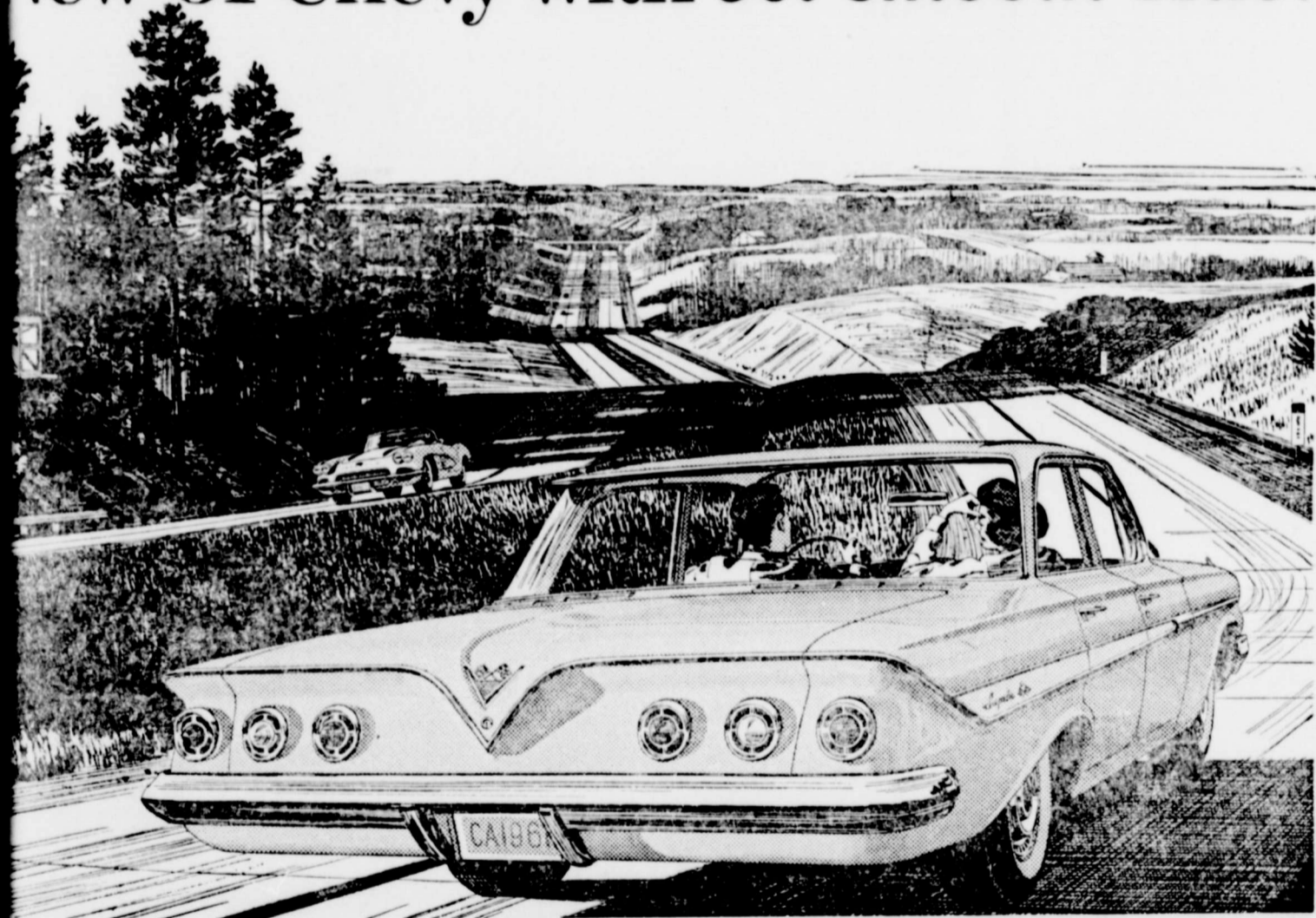
Impala 4-Door Sedan—Jet-smooth traveler that rivals the luxury cars in everything but price

The '61 Chevy loves to go because it goes so well. It runs along pavements like a happy tabby. Takes rough roads in stride and all roads in style.