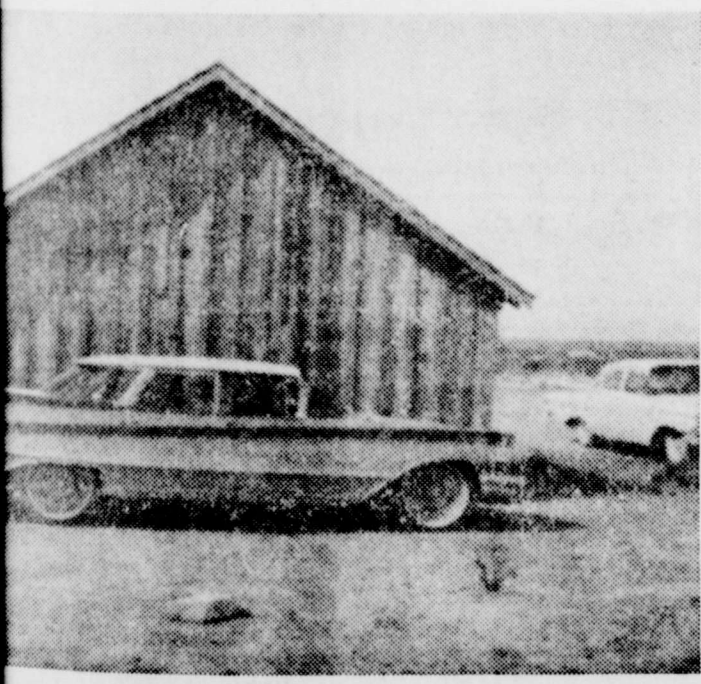
This 1960 Buick was the scene last week at the scene of a Pecos farmer and his wife were discovered. A garden hose was connected to one exhaust pipe near window. The automobile and its occupants were behind the barn shown in the picture, located 10 miles north of Rankin on the Midland Highway. No indications of foul play involved according to

New school facilities, which are almost complete, will also be inspected by the public at this time and will include the renovated junior high, the new band hall, the new administration building, the new bus barn, the enlarged shop department and other improvements.