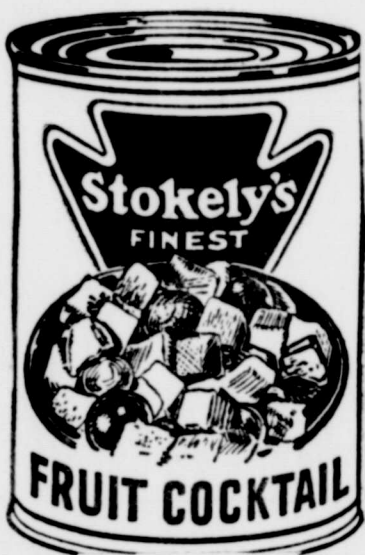
NO. 303 CAN—4 FOR