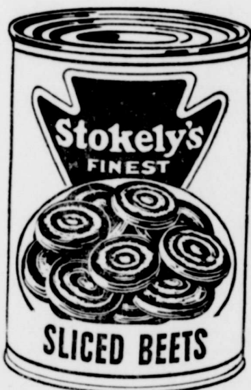
NO. 303 CAN—6 FOR