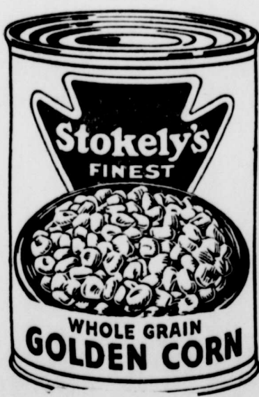
NO. 303 CAN—5 FOR