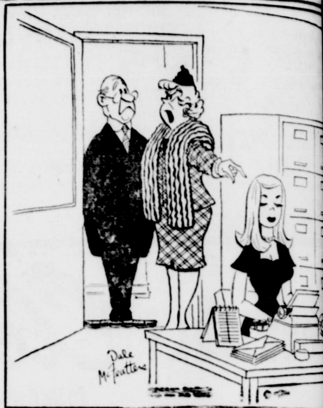
"I want her replaced by automation immediately."