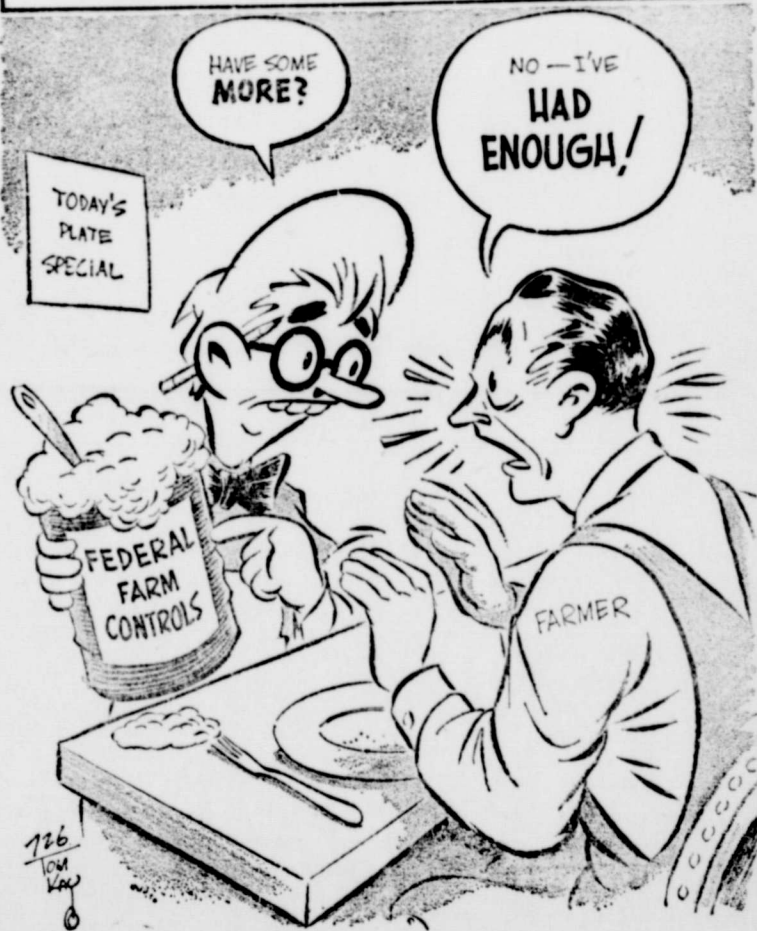
Can't Stomach Any More