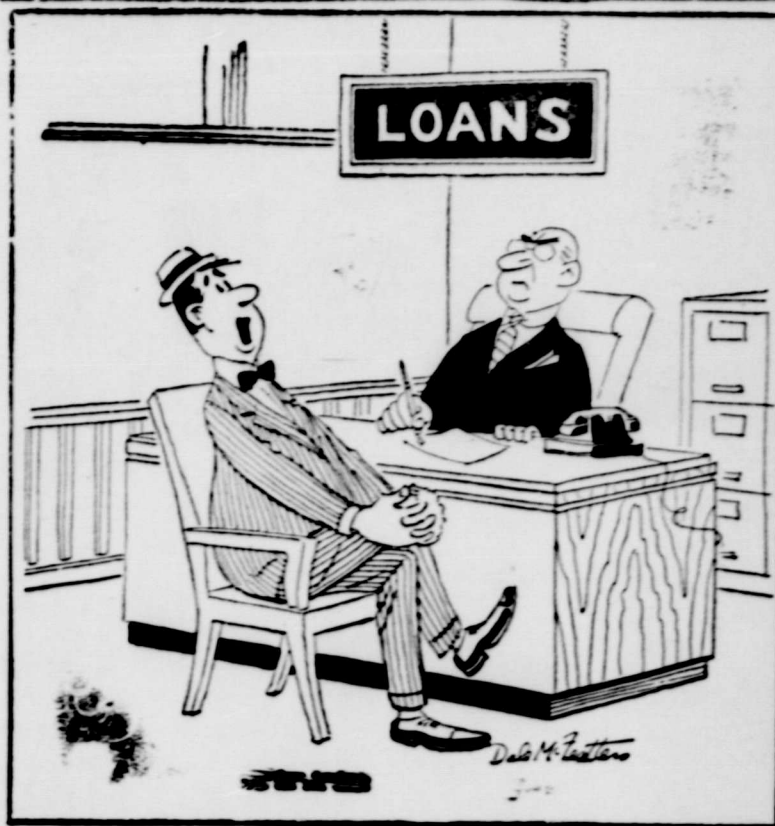
"My current bills aren't the problem—it's the ten-year-old ones!"