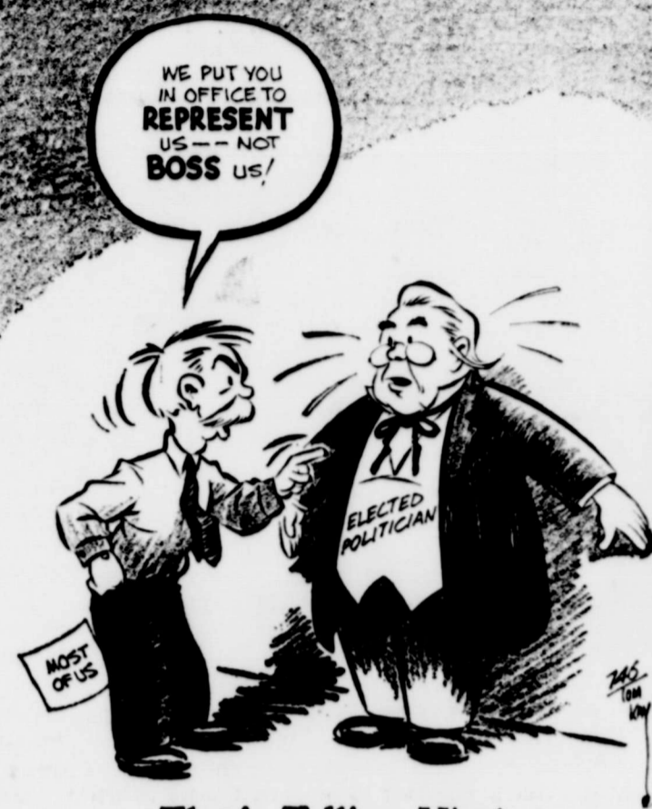
That's Telling Him!