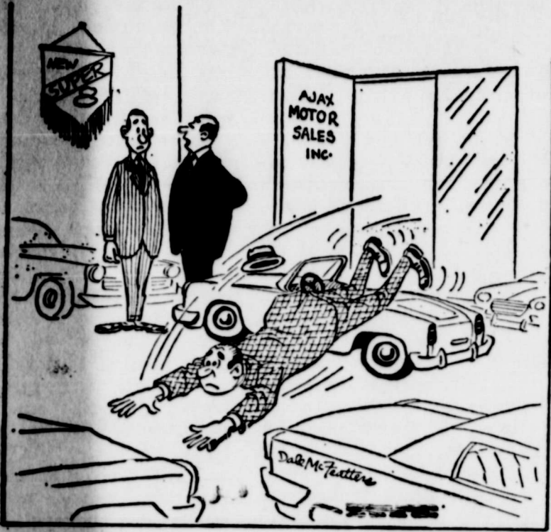
"When the customers start tripping over 'em, I figure they're low enough!"