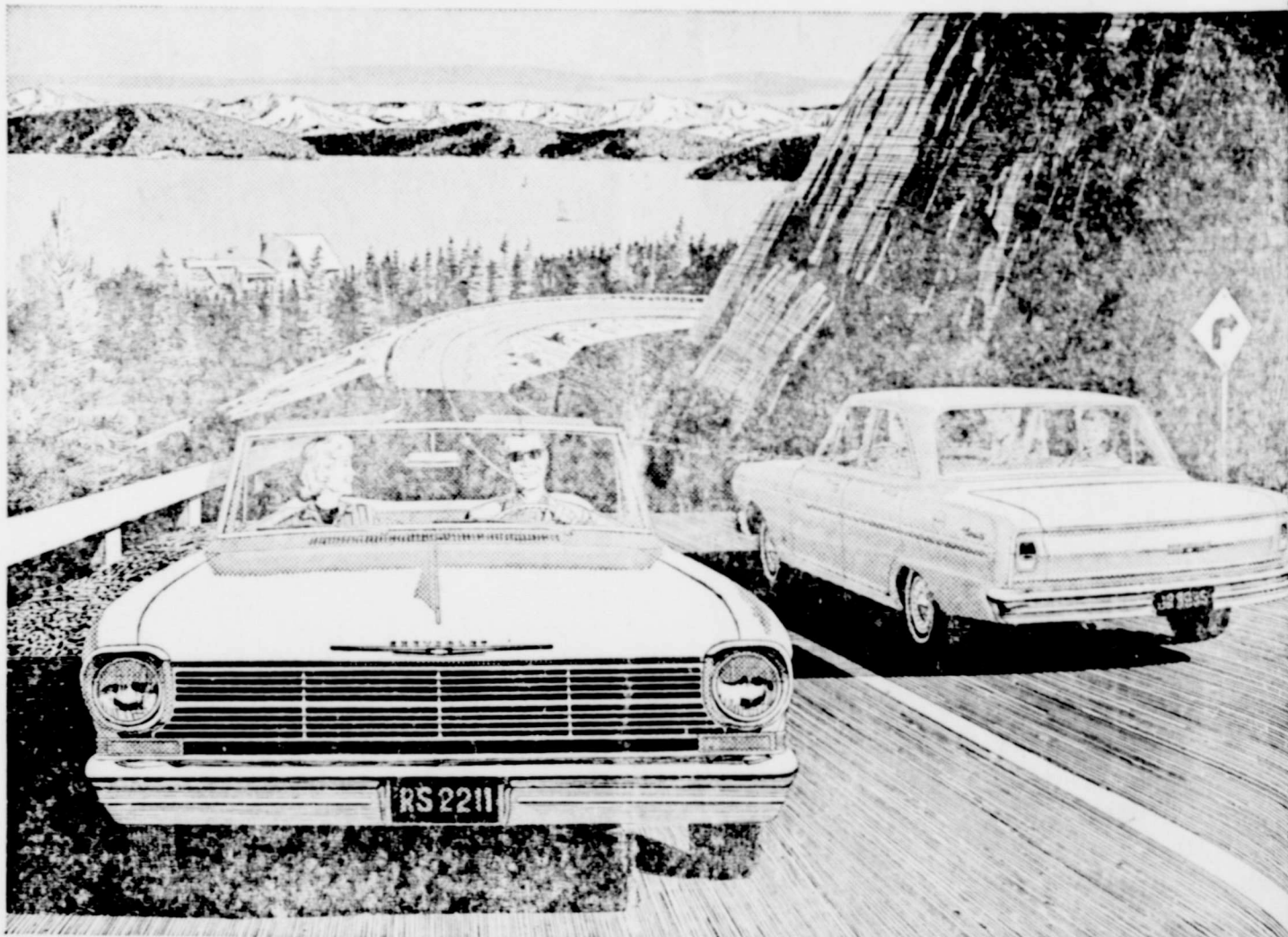
The sporty Chevy II Nova Convertible and sprightly 4-Door Sedan

See the new Chevy II at your local authorized Chevrolet dealer's