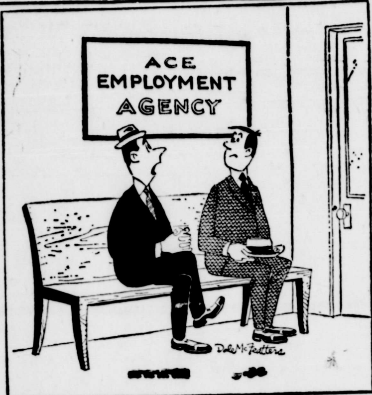
"So I said, I'll stand on my record!" Then he looked up my record and fired me!"