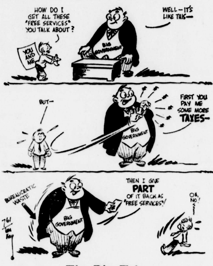
The Big Take