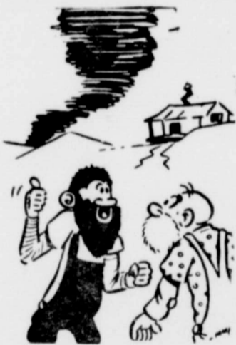
TWISTER'S COMIN' RECKON WE SHOULD INSURE TH' HOUSE WITH