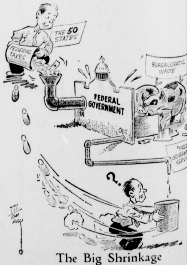
The Big Shrinkage