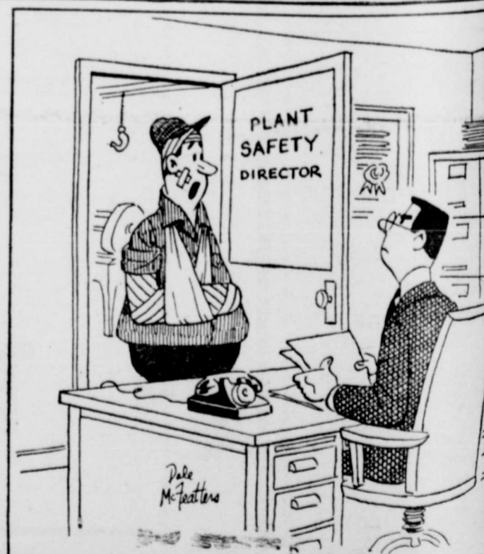
"I was reading the 'Watch Your Step' sign!"