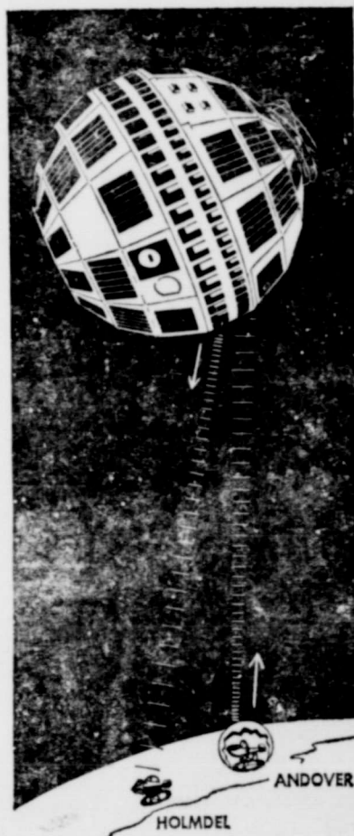
SATELLITE TALK —Telstar, the Bell Telephone System's first communications satellite, is now orbiting the earth at 16,000 miles per hour. White lines show how signals for phone calls, live television and other communications are sent from a ground station to the satellite and retransmitted to another earth station. Electronic gear on Telstar boosts signals 10 billion times for their return trip to earth. Telstar tests will help pave the way for a worldwide satellite communications system.

A number of Bell Laboratories inventions, including the transistor and solar batteries, are essential to Telstar's operation. The small transistors make possible the satellite's complex circuitry. Telstar is lined with 3,600 solar battery cells that convert sunlight into electricity for the satellite's power supply.