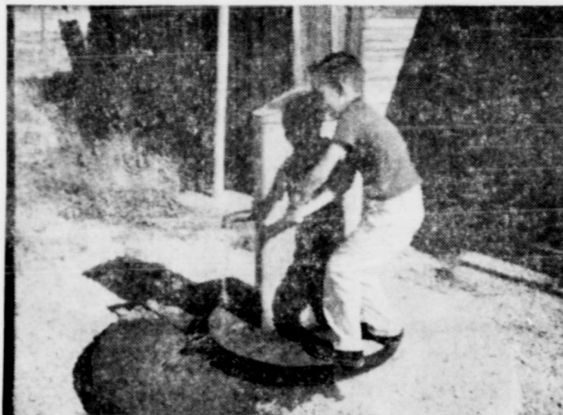
IT WORKS! — The Junior Editor of the Rankin cranks up an old hand pump on a cistern behind the old headquarters building at the J-M Ranch and is rewarded with a big splash of rainwater for his troubles. The old building is equipped with an elaborate installation of gutters, drain pipes and a filter system for trapping scarce rain water in the underground storage tank.