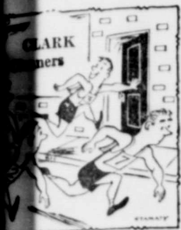
"I'll Catch Up with You."