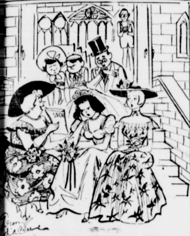
It wasn't a TOTAL loss . . . Look — the society refers to me as the prospective bride's witty and charming mother!"

This promises to be a thing well worth your time—aside from being for a good cause. The program is going to be considerably varied—something for everyone—and will include a lot of good laughs. Most of us get laughs daily from Washington but these will be of the different sort and won't hurt your pocketbook when you laugh.