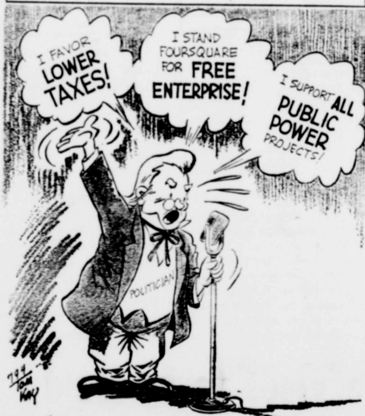
How Inconsistent Can He Be?