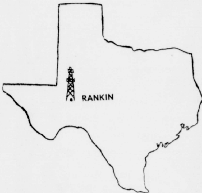
... as seen by Omicron Tau, Beta Sigma Phi on cover of club year book